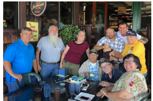
San Diego Chapter NANP members gather for a photo during their most recent quarterly luncheon.