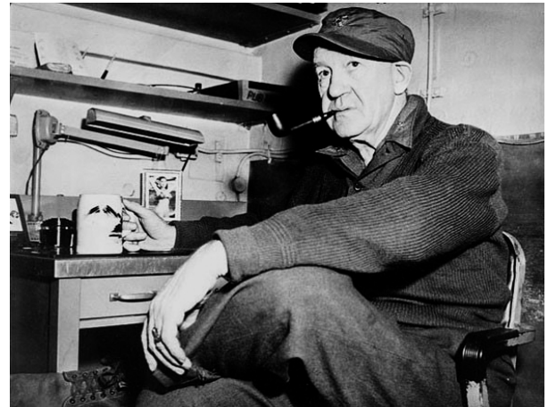
Retired Rear Admiral John Ford, U.S. Naval Reserve, in 1952. His fame as the director of Western movies notwithstanding, the Hollywood icon had a lifelong love affair with matters maritime, specifically the U.S. Navy. Undaunted by a turndown from the U.S. Naval Academy after high school, he eventually maneuvered his way into a commission at age 40, and served in World War II and Korea.