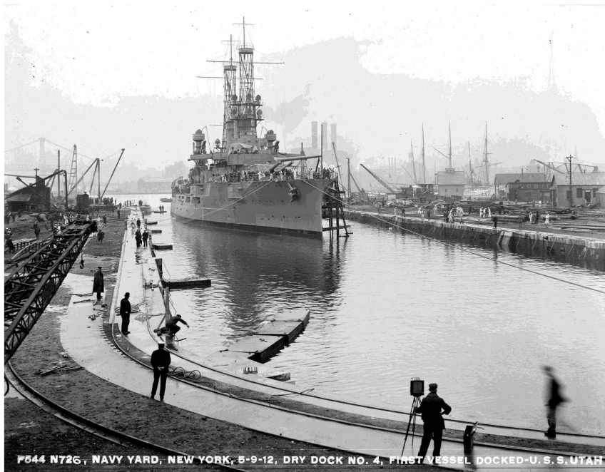
P644 N726, NAVY YARD, NEW YORK, 5-9-12, DRY DOCK NO. 4, FIRST VESSEL DOCKED-U. S. UTAH USS Utah, BB-31, The first ship to enter Dry Dock #4 at the New York Navy Yard. Location: Brooklyn, NY. Date: May 9, 1912.

The following is a small selection of the images I found doing research at the Archives.