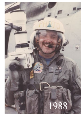
Cont. pg. 2