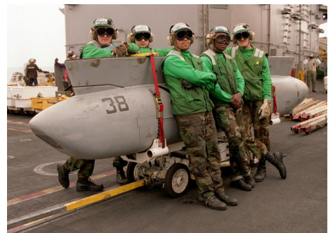
TARPS Pods installed on F-14