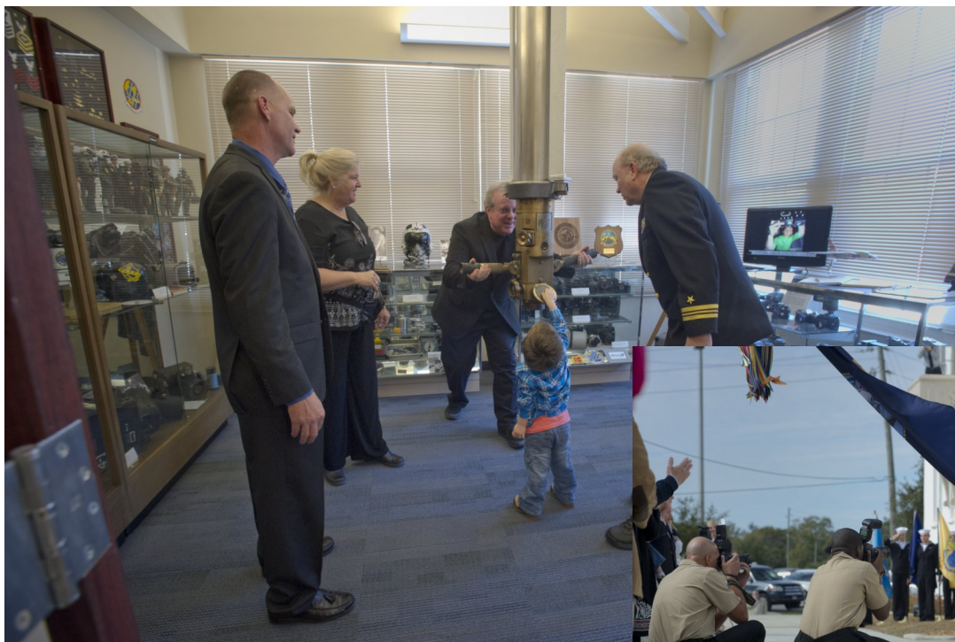
Richardson family at periscope room display